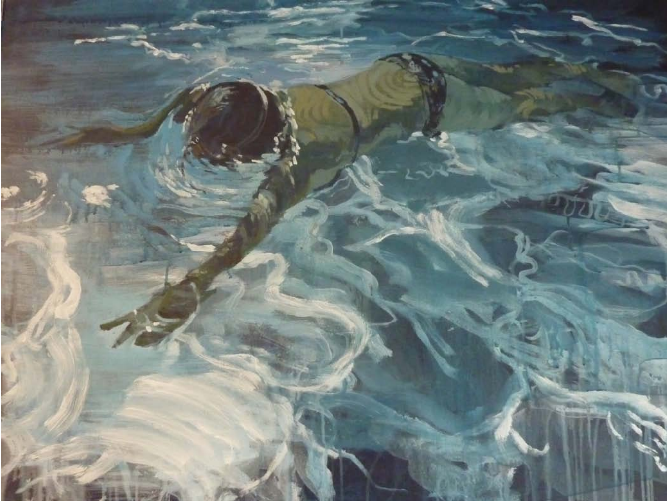
"Reach" Acrylic on Canvas 76 x 110cm

A figure dives into water and their body becomes transformed, a refracted and reflected self distorts through the transparent space. Light dances across the form of the swimmer bringing it to life and on the surface of the water. This perceptual flicker, the layering and transformation offer limitless possibilities.