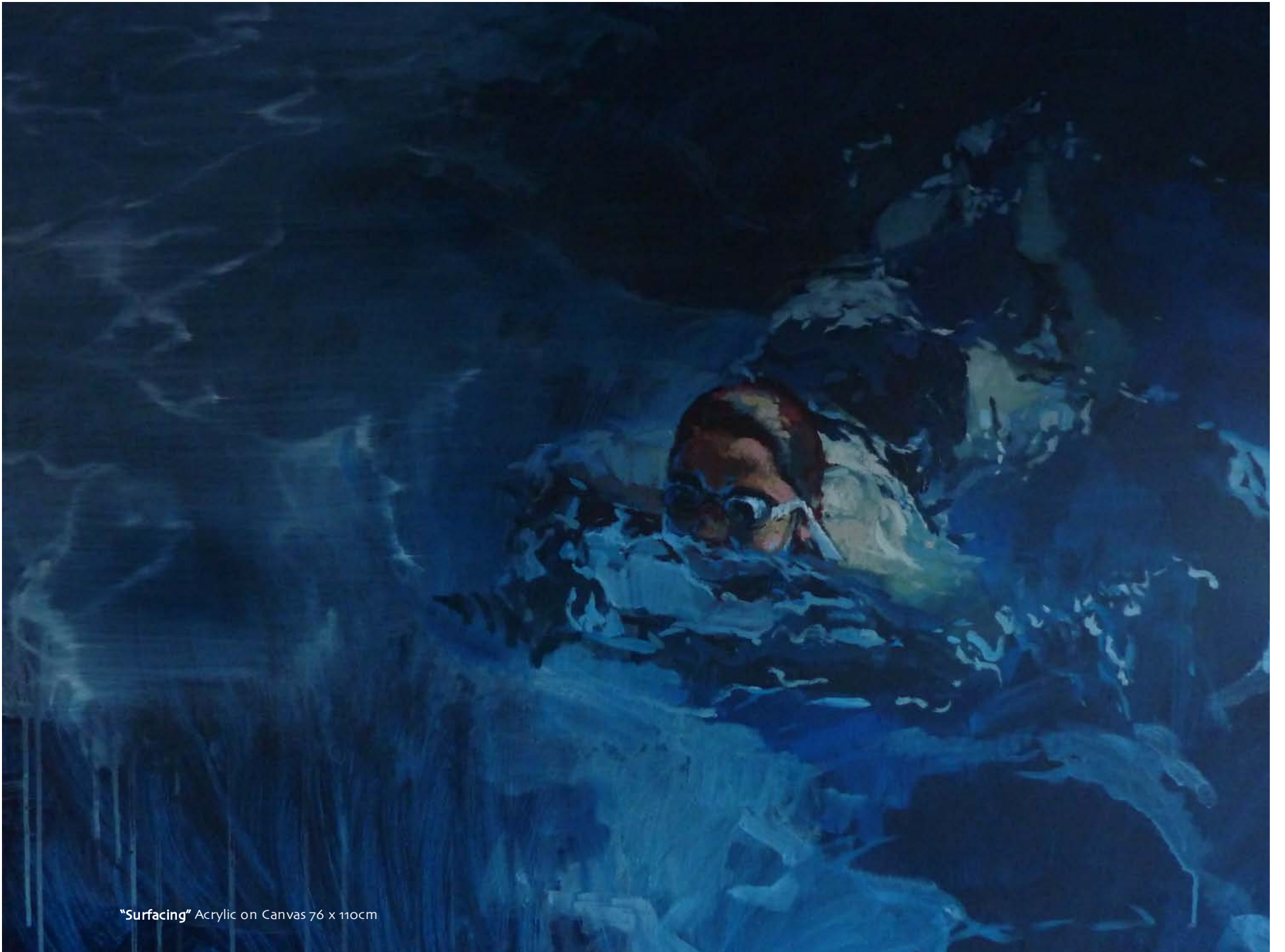
"Surfacing" Acrylic on Canvas 76 x 110cm