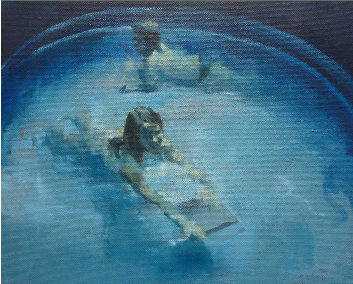
"Float" Oil on Canvas 25 x 30cm

2007 Zimmer Stewart gallery New Grafton gallery Highgate Fine Art