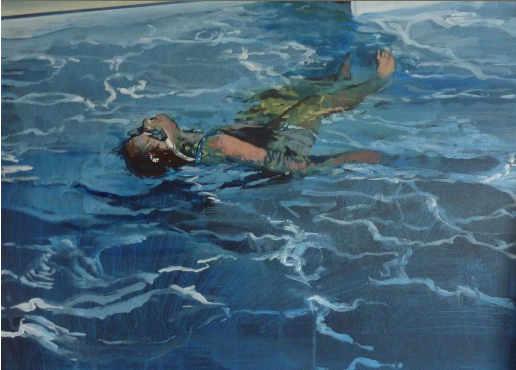
"Floating" Acrylic on Canvas 52 x 76cm