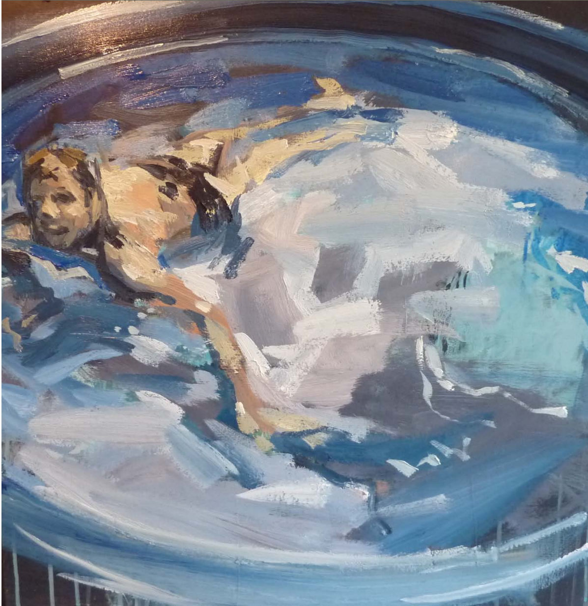
"Paddling" Acrylic on Board 61 x 61cm