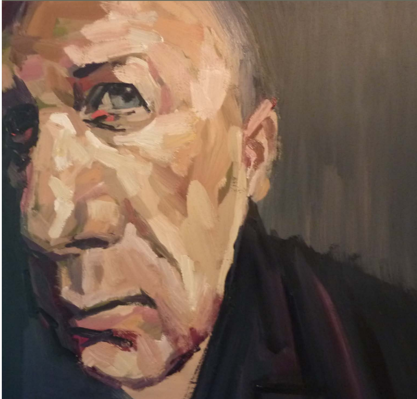
"Head 7" Acrylic on Board 61 x 61cm