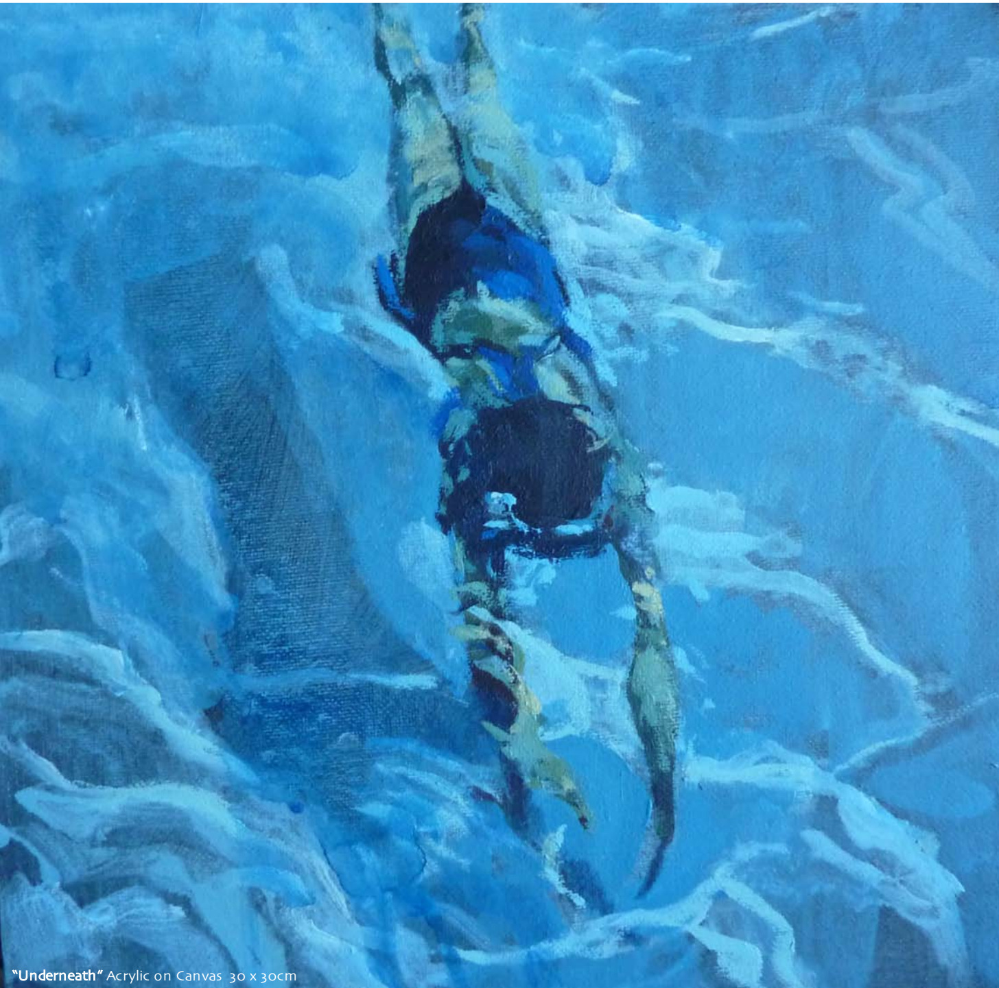
"Underneath" Acrylic on Canvas 30 x 30cm