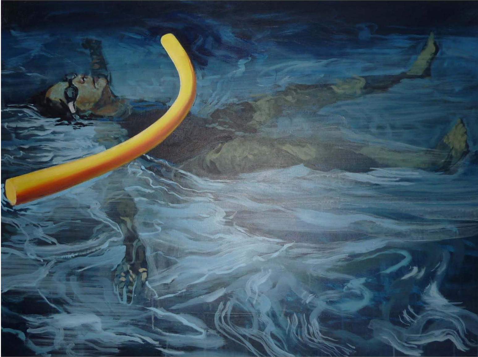
"Noodle 2" Acrylic on Canvas 76 x 110cm