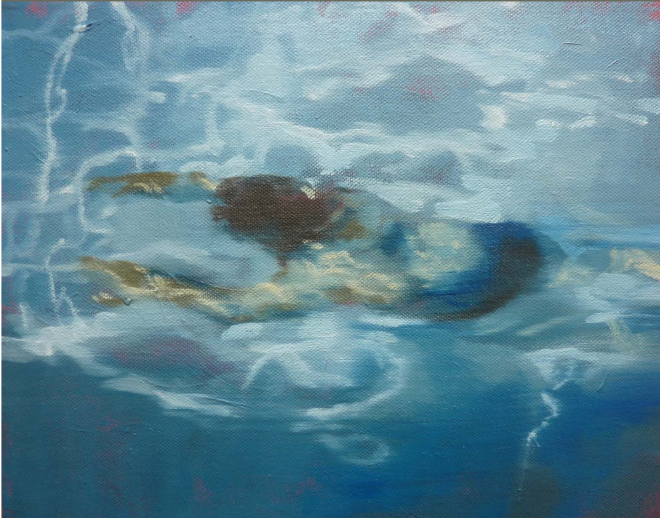
"Underneath 3" Oil on Canvas 25 x 30cm

2000 Brighton Festival Deepdale Exhibitions Fairfax Gallery Hung Drawn and Quartered, Phoenix Gallery, Brighton Lewes Contemporary Art 'A wider view' Sussex Landscapes. Mayfield Festival