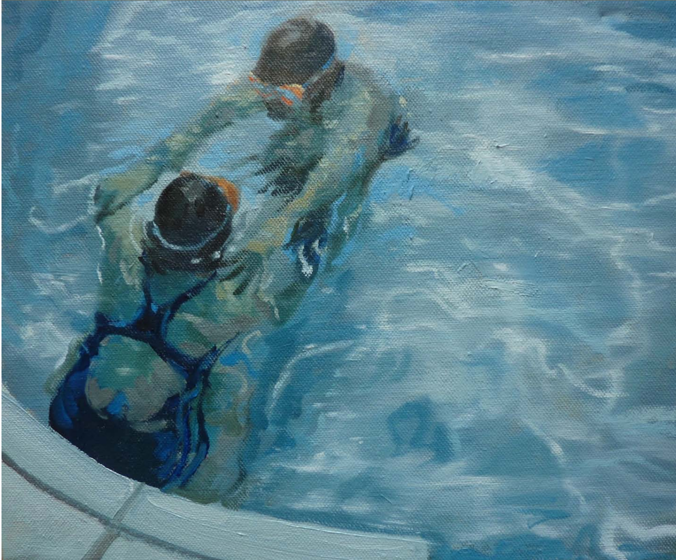
"Holding" Oil on Canvas 25 x 30cm

1992 Bury St Edmunds Art Gallery Deepdale Exhibitions 'Pacesetters 12' Peterborough 'Young Artists South East'